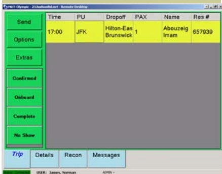
Trip Summary Screen