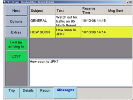
2-Way Message Detail Screen

For more detailed information on hardware options, vehicle mounting choices or to discuss how the HWeb MDT solution could be customized to meet your specific needs please give Hudson's Business Development staff a call.