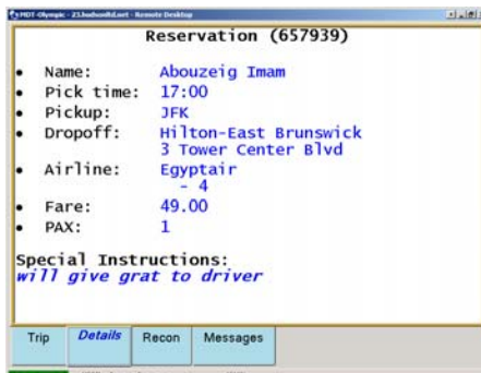
Reservation Detail Screen